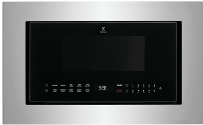
Install Trim Kit Required, EMTK3011AS Sold Separately