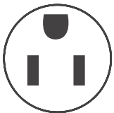
Plug Type (NEMA) 5-15P

1 Warranty 5 year sealed system/1 year full parts and labor.