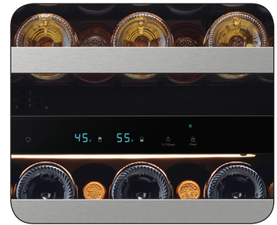
Dual Temperature Zone