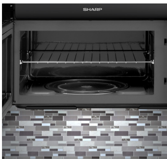
Chrome grill rack accessory included for multi-level cooking and reheating

The powerful, 2-speed ventilation system is effective up-to 300 cu. ft. per minute, and features easy-to-reach, easy-to-replace filters. The Simply Better Clean enamel coating inside the oven is stain resistant and wipes clean with a damp cloth. With decades of experience designing innovative cooking appliances, it's easy to see why cooks around the world trust Sharp.