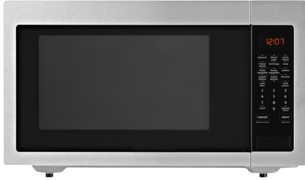
Fingerprint Resistant Stainless Steel UMC5225GZ