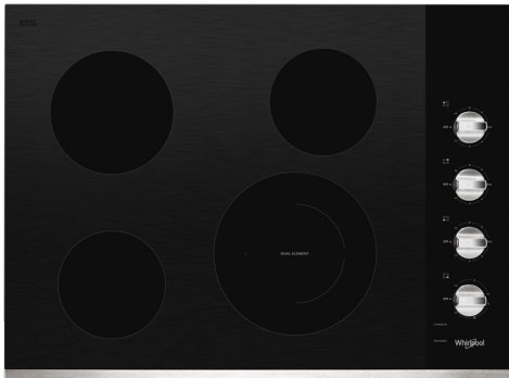
Stainless Steel WCE55US0HS