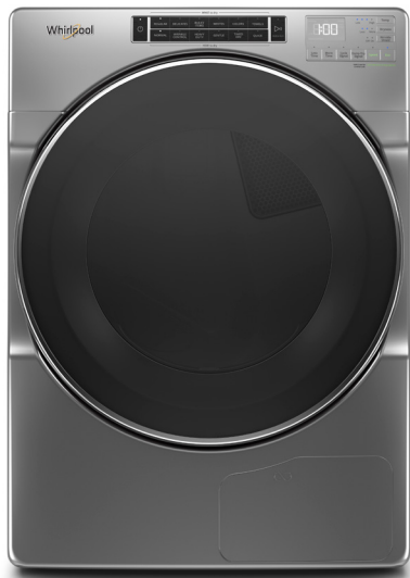
Chrome Shadow WHD862CHC