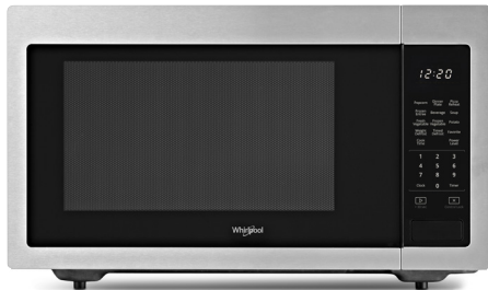
Fingerprint Resistant Stainless Steel WMC30516HZ