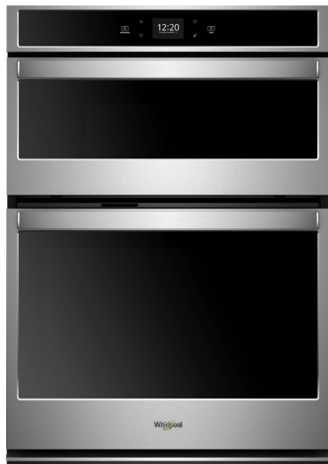
Stainless Steel WOC54EC0HS