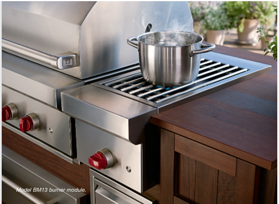
Model BM13 burner module.

The Wolf burner module lets you prepare side dishes or warm barbecue sauce without having to run inside. Constructed of heavy-duty stainless steel, the 25,000 Btu model BM13 burner module can be built into an outdoor kitchen, and the model SB13 side burner is designed to be attached to a portable grill cart. Available in natural or LP gas.