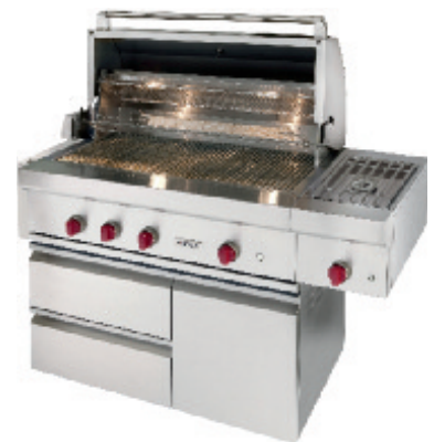
Model SB13 side burner, shown with outdoor grill and portable grill cart.

Accessories are available through your authorized Wolf dealer. For local dealer information, visit the find a showroom section of our website, wolfappliance.com .