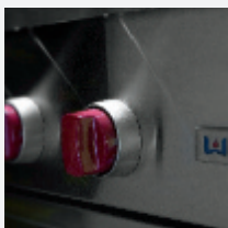
LED lit control knob (outdoor grill shown).