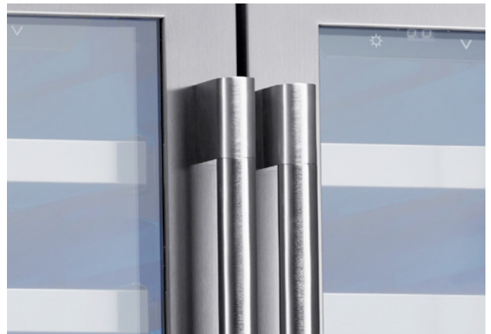
Optional Pro Handles