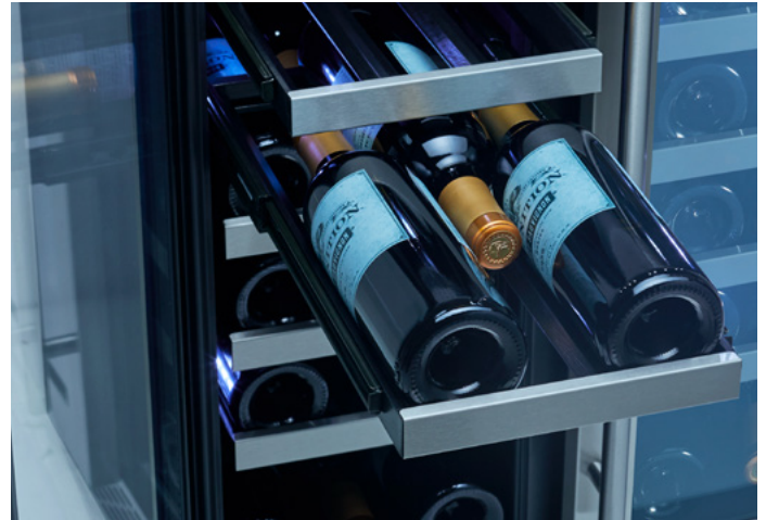
Full Extension Wood Racks